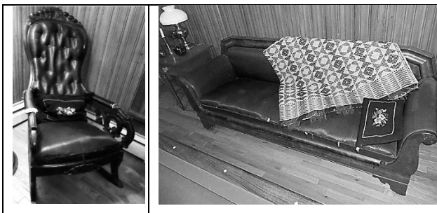
Horsehair furniture in the Billiards Room

The house takes pride in being open to welcome the community. Because of this, some of our furniture needs to be restored in order to safely be used and enjoyed once more. Two chairs and a sofa, in particular, are in need of some well-deserved TLC. Such a project is a perfect occasion for us to learn more about the holdings of our collection and also about the furniture that used to be part of a typical Victorian home. The sofa is of special interest, as it is upholstered with horsehair fabric. Not only was horse hair gathered from the animals' mane and used to stuff the back and seat of Victorian furniture, the longer hair from the horses' tails could also be woven with cotton or silk warps to manufacture horsehair fabric, a favored upholstery material during the 19 th century. Not surprisingly, horsehair fabric is no longer as readily available as it was during the last century and is now cost prohibitive. For practical purposes, we will use different types of fabrics, which would have also been encountered in Victorian sitting rooms. We will keep, however, examples of horsehair furniture in the Billiards Room.