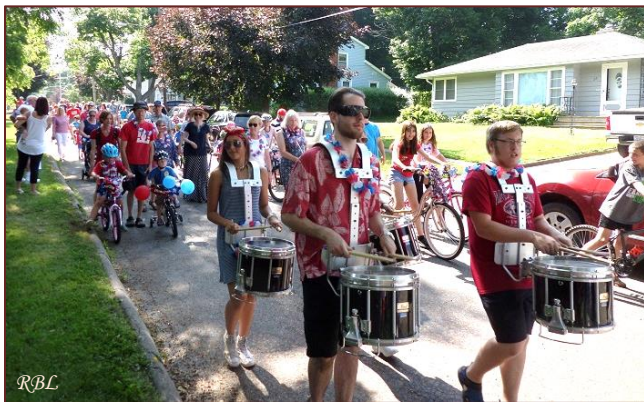
The group of talented drummers leading the parade.