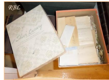
Work in progress: some of the Morgan papers are still kept in boxes. They soon will be in archival folders.